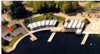
The starting point is at the Aqua Theater at 9 am