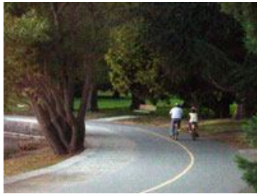
Plenty of room for walkers