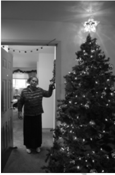
Holiday Decorations at the Day Center and Transitional Housing